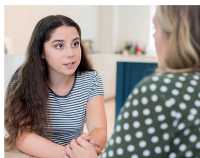
■ The Conservatives are investing in the safety of women and girls

At the same time, the government is increasing the support they give to victims, investing over £230 million to help those who have suffered from domestic abuse.