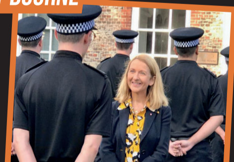
Police & Crime Commissioner Katy Bourne has delivered highest number of police officers in over a decade >>>